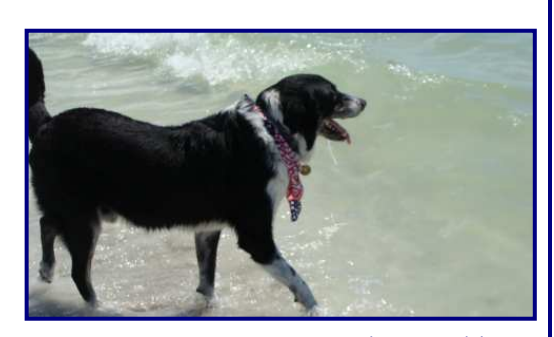
Skye says, "Join me on the beach!"

Editor's note: Did you know that you can bring your pooch with you on your cruise? Just ask about our Pet policy! And remember, if you want to add a new canine or feline friend to your family, please adopt!